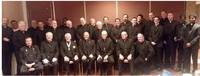
Priests attending the biennial Clergy Night