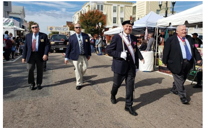
The delegation at the Federal Hill Columbus Parade

During the previous month (October) we naturally celebrated the day of our namesake, Christopher Columbus, the great explorer who opened the Americas to European awareness which led to the expansion of Christianity. Knights delegations attended 3 Parades held for the occasion. Parades were held in Westerly, Providence and Woonsocket.