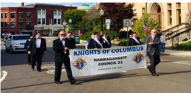
Marchers in the Westerly Columbus Parade